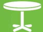
TABLES + COUNTERS