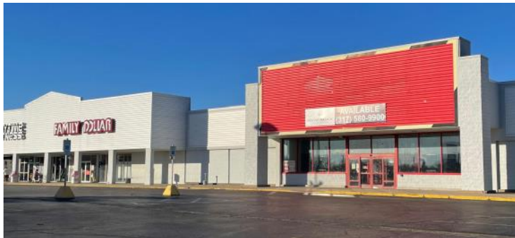
This spring, Harbor Freight opened a New Castle location at 1709 S. Memorial Drive. The retail location in the Kalpritt Mall was formerly home to Staples and JT Mega Discount Ware.

“It is our hope that when the new practice arena is completed, we will be able to add additional shows extending our show season,” the board continued, “but we are very pleased to have added three new shows in 2024 that will be larger shows allowing us to make additional improvements specifically in electric lines and poles.”