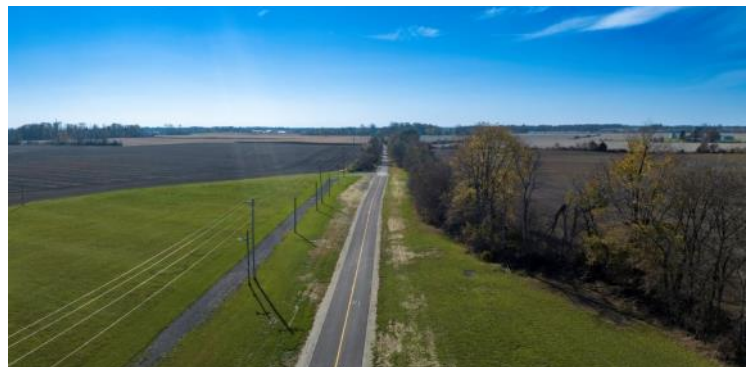
The Wilbur Wright Trail extension in Mooreland was one of the Henry County projects that received funds from READI 1.0.

With regional applications due to the IEDC by February 16, 2024, the IEDC review committee will consider applications and determine regional grants in April/May. Local projects may then be considered for funding in the summer.