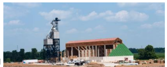
Construction progress photo of Co-Alliance Mt. Summit facility taken in summer 2023.

Co-Alliance also selected Millville for the location of an $18 million feed mill. The mill will produce 300,000 tons of feed annually. The project also includes a warehouse and office space. The feed mill plans to take in corn from local growers to meet demand.